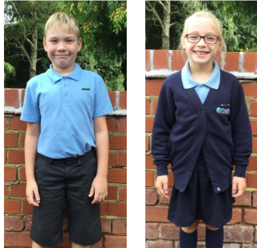
Congratulations to all children chosen this year